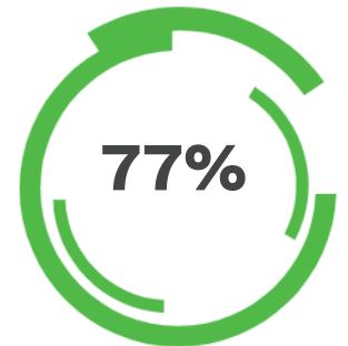
DDoS Attacks Use Two or More Vectors

Neustar, 2019 Q1 Cyber Threats & Trends Report