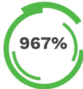
Increase in DDoS Attacks 100 Gbps or larger compared to Q1 2018