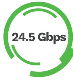
Average Size of DDoS Attacks